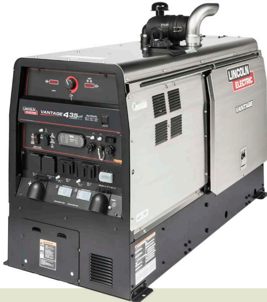
Shown: Vantage® 435 (K4107-2)