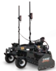
Laser Grading Box