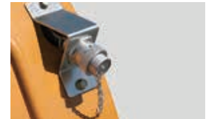
Front Electric/ Multi-Function (excl. SR160)