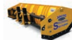
Arctic® Sectional Sno-Pusher™

SEE OUR FULL LINE AT CASECE.COM/ATTACHMENTS