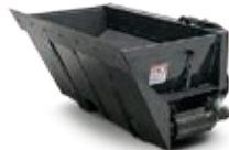
Side Discharge Bucket