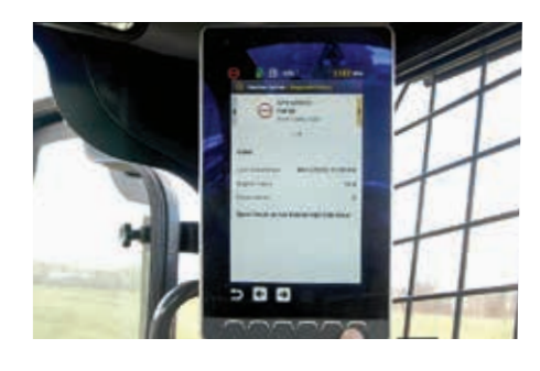
EASE OF TROUBLESHOOTING

Service is simple. Regular check points are grouped into a single area under the engine compartment cover, easily accessible through the heavy-duty rear door. The entire cab tilts forward in just a few easy steps to access the entire drivetrain compartment for easy service and inspection.