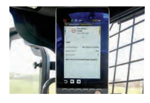
EASE OF TROUBLESHOOTING

Service is simple. Regular check points are grouped into a single area under the engine compartment cover, easily accessible through the heavy-duty rear door. The entire cab tilts forward in just a few easy steps to access the entire drivetrain compartment for easy service and inspection.