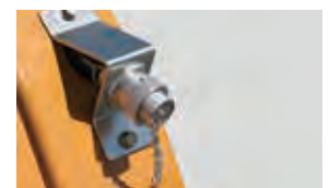
Front Electric/ Multi-Function