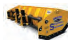
Arctic® Sectional Sno-Pusher™