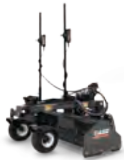
Laser Grading Box

All models come standard with a universal coupler that will work with numerous attachment manufacturers, meaning you can do more with a single machine to give your business even greater versatility. Consult your dealer for details.